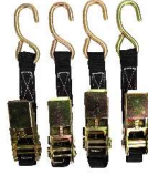
4 x Ratchet Straps (C)